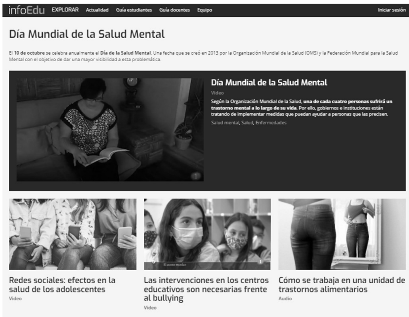
Figure 2. Image of the home page of the InfoEdu project

of MILID. As a first general result, this initiative allows us to stress the importance of devising MILID projects that are conceived from approaches that involve a wide variety of profiles, including teachers, students, and families, to promote public good. Students and teachers can find more than 300 audiovisual resources on the website, enabling them to access the content that best suits their educational level (primary, secondary, high school, and university), their age (children, teenagers, and adults), and the subject they are studying or teaching (natural and social sciences, history of art, and Spanish language and literature). In addition, users can filter the content by subject, duration, or profile. The platform compiles reports, chronicles, documentaries, interviews, and so forth from the Spanish Radio and Television Corporation and the media that make up the Association of Ibero-American Educational and Cultural Television (ATEI), an aspect that guarantees the quality of the information made available to students and teachers (see Figure 2).