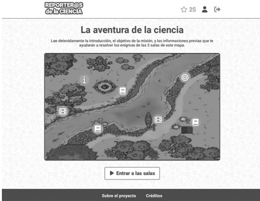
Figure 4. Detail of one of the multimedia escape rooms of the Science Reporters project