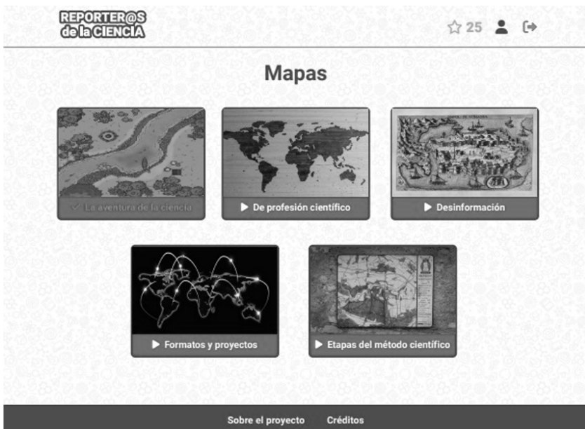
Figure 3. Image of the multimedia escape rooms of the Science Reporters project

At the methodological level, the project “Science Reporters: The adventure of knowledge,” which addresses how to train young people between 12 and 16 years of age through games, strengthens the MIL approach based on a detailed study of the digital world that surrounds and entices these young people. Thus, the proposal is articulated around a collection of multimedia escape rooms in which young people are the protagonists. The project works with MIL from an approach that encourages creativity, the search for solutions, and collaborative work but also focuses on competition between students and schools. The initiative has an ecosystem of game-based deliverables: on the one hand, an educational multimedia game and, on the other hand, a collection of five multimedia interactive escape rooms. The project has developed its contents from a gender perspective and is based on the 17 SDGs promoted by the UN. The proposal seeks to generate a network of schools that work together to promote critical thinking based on recreational proposals that are open to constant updating and improvement (see figures 3 and 4).