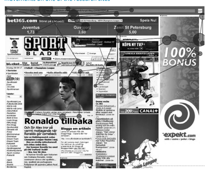
Figure 1. Scan path of a research participant, indicating the path of eye movements on one of the research sites

Note. Reprinted from Children's exposure to and perceptions of online advertising (p.337)