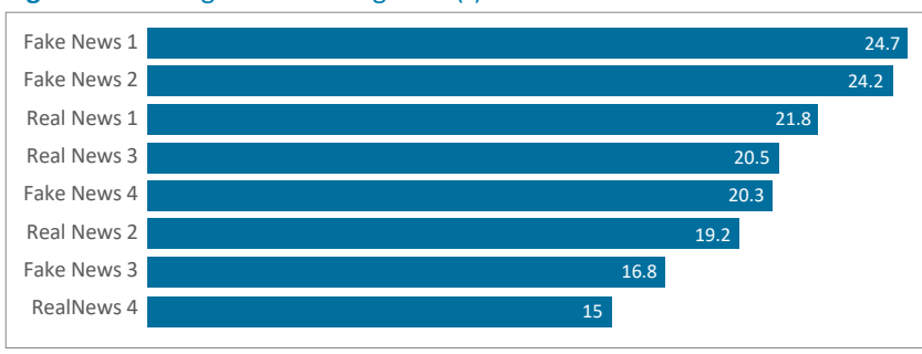
Figure 3. Reading: Total reading time (s)