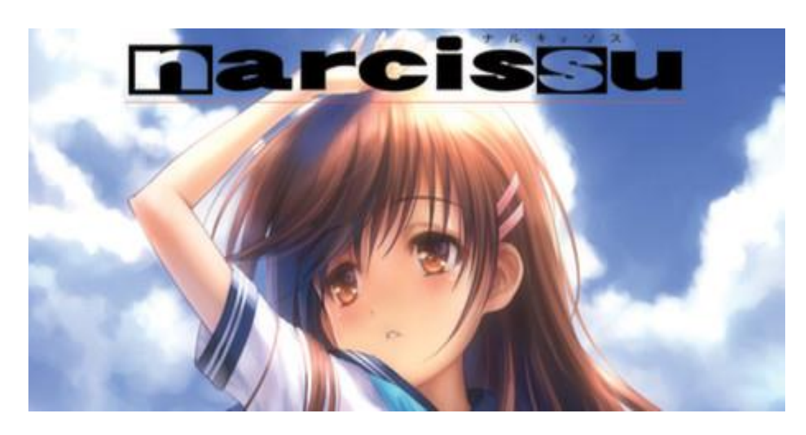
(Narcissu, Steam 2007) https://cutt.ly/Grd0oky