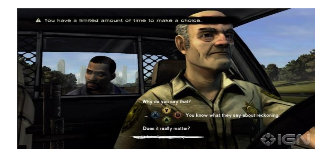
(The Walking Dead: Season 1 Game Review, glamorousgamergirls, 2014)

Large companies such as Sony and Sega have created a great number of videogames genres to satisfy players demands. This is, in large part, because it elicits more visual responses, feedback and active participation from players. One of those videogames genres is Graphic or Visual novel. These games are oriented to bring a narrative story in which players make decisions in specific moments according to the scenes, situation and context of the story. One of the visual novels that can bring an illustrative example of this type of videogames is The Walking Dead. This game places the player in a world of decisions for surviving against zombies. Its enterprise creator is TellTale Games. The genre's goal is that the player takes the role of the protagonist. The player must face some issues during the story bringing different types of decision-making statements. The player is given the intention of choosing only one statement according to what the player think is the best option. (The Walking Dead videogame, n.d.).