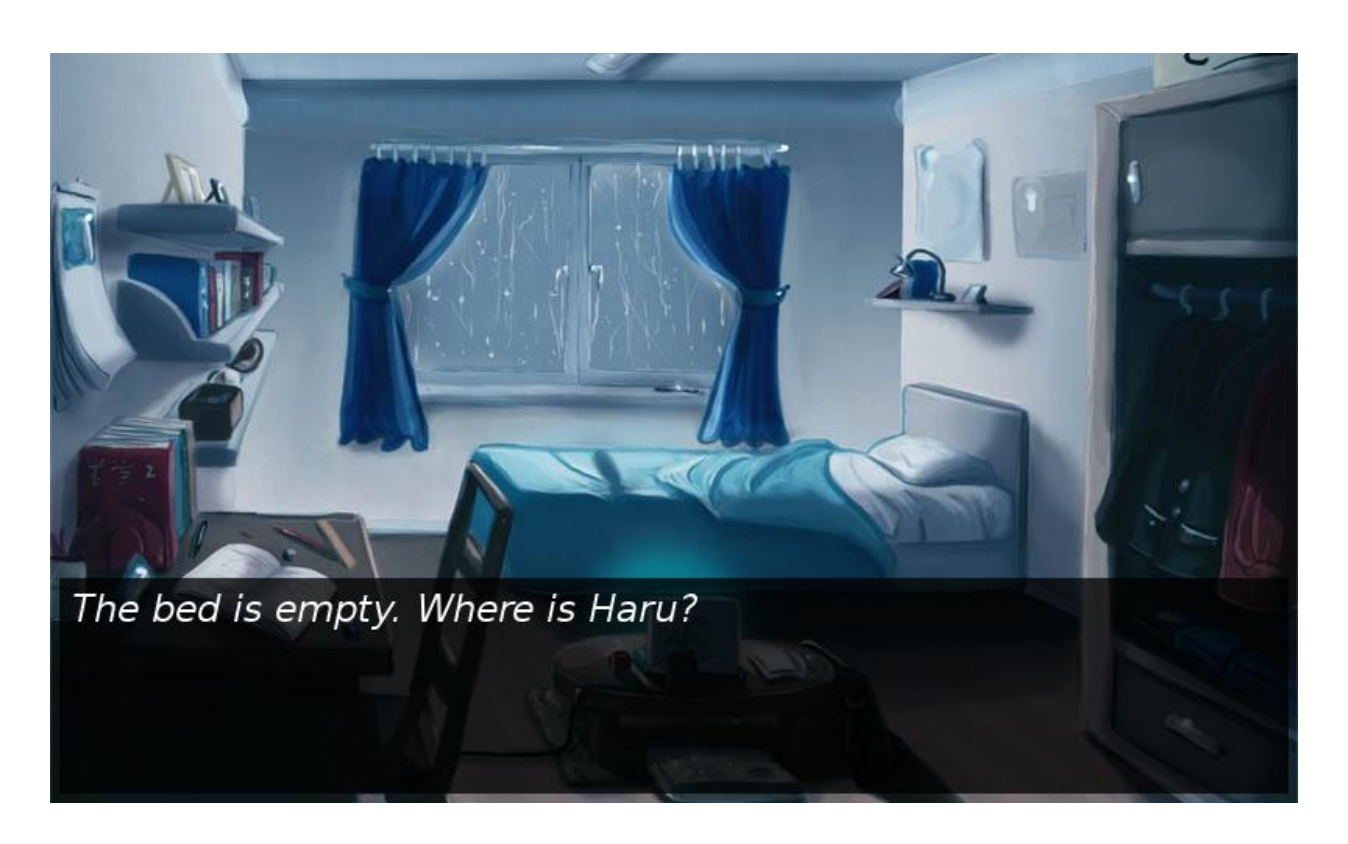
(Sleepless Night, apkpure.com, 2014) taken from: https://cutt.ly/jrd1JW0

Sleepless night: Marcel Weyer's creator description: "is a horror/psycho sound novel. For the full game experience, you should play at night alone in your room and turn the volume up. There are no 18+ scenes in the game, I would recommend the game for 13+, but it is very scary and there are a lot of shockers in it, so be warned!". (https://cutt.ly/Yrd1VGi)