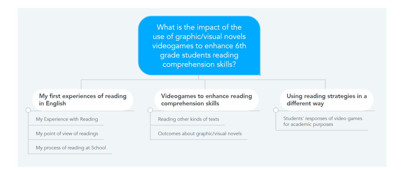
Figure 3. Atlas.ti Categories and sub categories for Data Analysis.