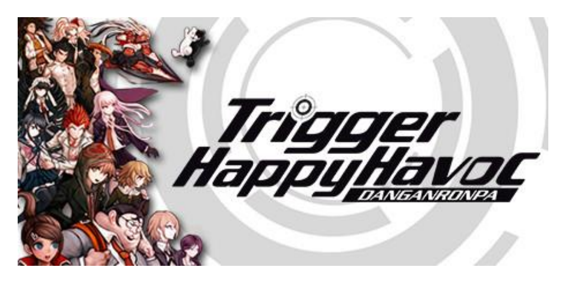
(Danganronpa: Trigger HappyHavoc, Steam) <a href="https://cutt.ly/Jrd0zWo">https://cutt.ly/Jrd0zWo</a>

Danganronpa - Trigger Havoc : Steams' Description: "Investigate murders, search for clues and talk to your classmates to prepare for trial. There, you'll engage in deadly wordplay, going back and forth with suspects. Dissect their statements and fire their words back at them to expose their lies! There's only one way to survive—pull the trigger". (https://cutt.ly/Qrd15ga)