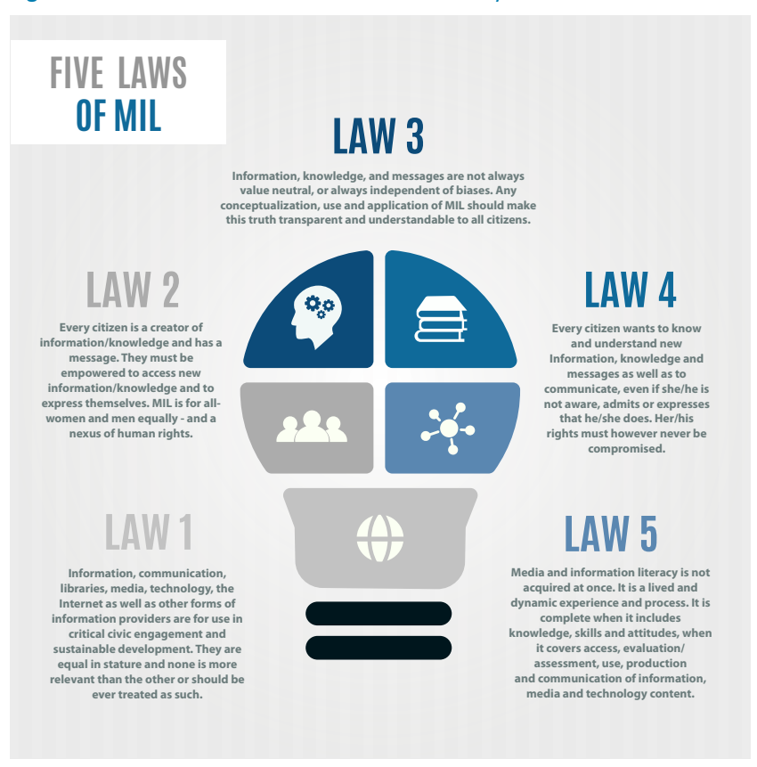
Figure 2. 5 Laws of Media and Information Literacy